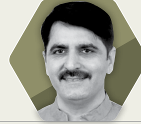
HON'BLE MINISTER OF STATE FOR ENVIRONMENT AND URBAN DEVELOPMENT, GUJARAT SHANKAR CHAUDHARY