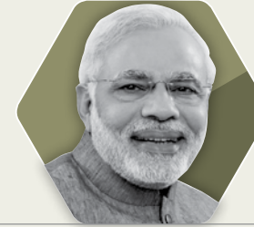
HON'BLE PRIME MINISTER OF INDIA NARENDRA MODI