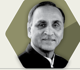
HON'BLE CHIEF MINISTER GUJARAT STATE VIJAY RUPANI