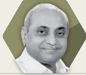
HON'BLE DEPUTY CHIEF MINISTER, GUJARAT STATE NITIN PATEL