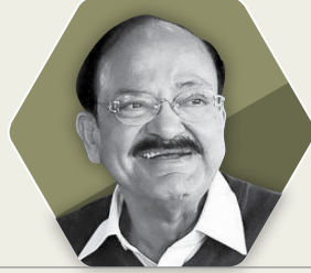
HON'BLE MINISTER OF URBAN DEVELOPMENT, HOUSING & URBAN POVERTY ALLEVIATION AND INFORMATION AND BROADCASTING GOVERNMENT OF INDIA M. VENKAIHAH NAIDU