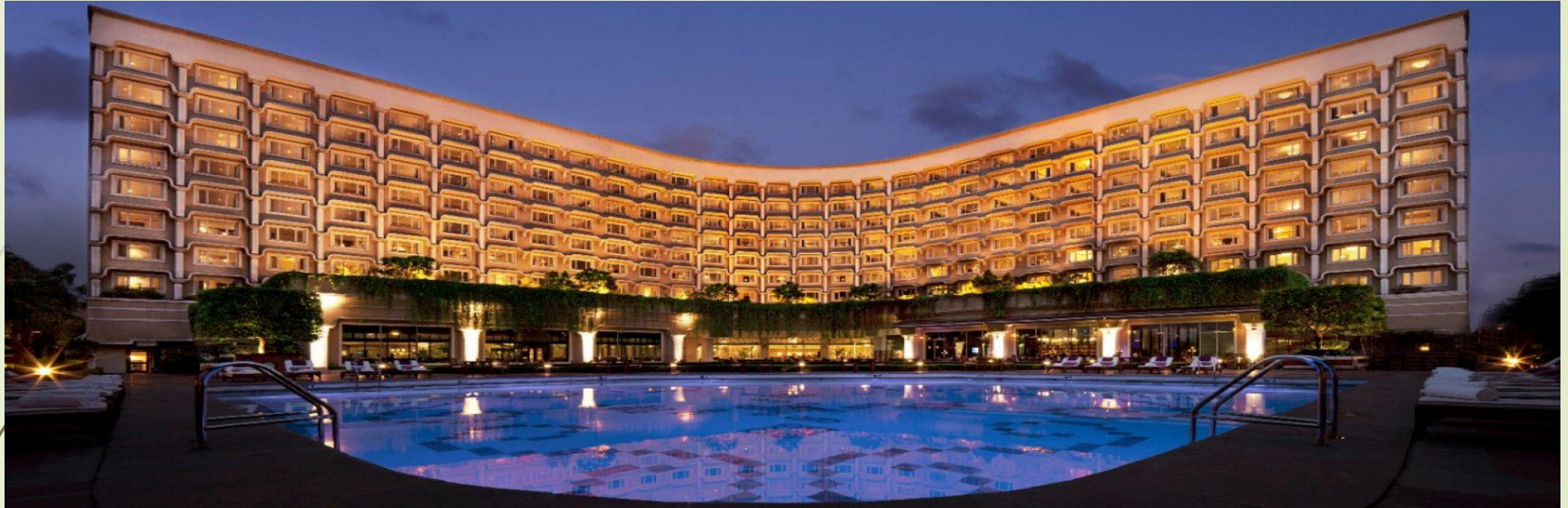
TAJ PALACE- NEW DELHI